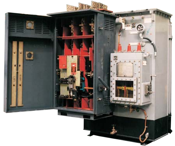
750/840 kVA 13.8kV8-216Y/125 V Network Transformer

All tanks are of the “sealed tank” design, manufactured by an outside specialized supplier. They are designed to withstand a pressure of 7 psig and they accommodate all fittings as required by customers specifications. If necessary, radiators can be conventional panel types or parallel panel types. All tanks are surface grid-blasted and then painted with two coats of epoxy primer, followed by two coats of urethane. Special coatings are available on request.