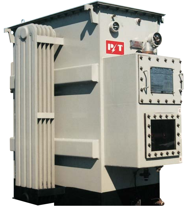
750 kVA 13.8kV8-208Y/120 V Network Transformer