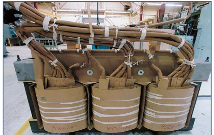
Core & coil assembly

50 years of core & coil clamping experience result in a solidly braced design that withstands short circuit conditions.